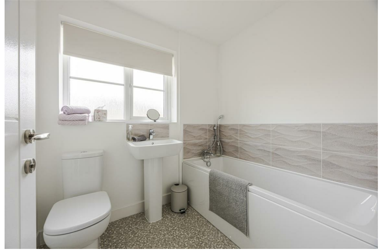
Bathroom 7'2" x 5'6" (2.20m x 1.70m)